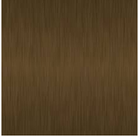
Brushed Bronze - BBZ